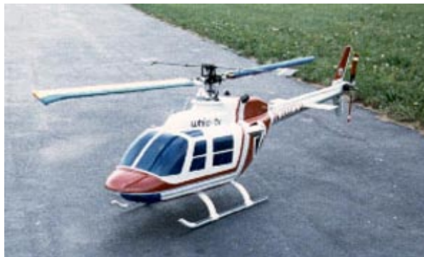
WHIO Ch 7 Bell Jet Ranger

News You Can Use Dept AMA will not cover your accident if you do not have your AMA membership ID# marked Somewhere on your aircraft. Write it on the inside of your canopy with a permanent marker if you must, just beware that many folks miss this clause.